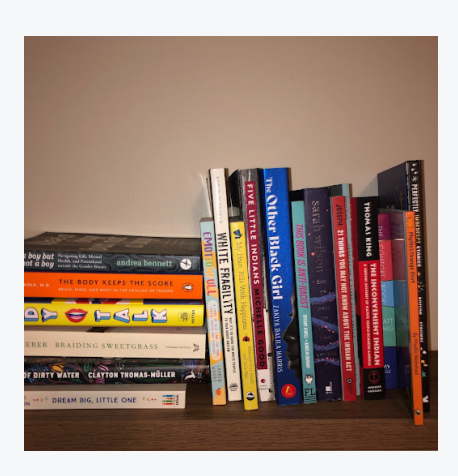
Jessica / Social Justice Library / NL

"Mental health and social justice are one in the same! With our free 'mini community library', we are making mental health and social justice information more accessible for everyone! Our library is quite diverse, we have books available for all ages and some topics include: mental illness, racism, gender diverse representation, Indigenous literature, body image, and so much more!"